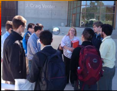
Arriving at JCVI